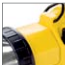
Hi Vis Yellow