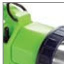
High Vis Lime Green